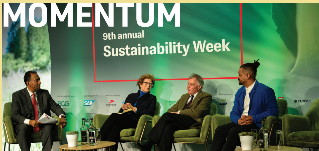
Beyond the Trees was featured at The Economist's 9th Annual Sustainability Week.

The forest climate solution is right in front of us, but most people are unaware of its massive, immediate potential.