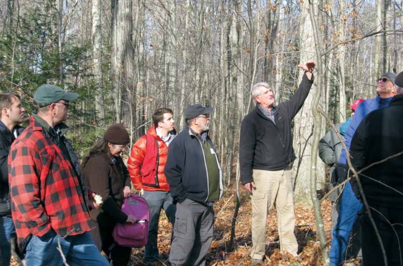
At a workshop at the Harvard Forest in Massachusetts led by Ecotrust staff, foresters discuss baseline and inventory requirements for registering forest carbon projects.